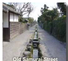
Old Samurai Street