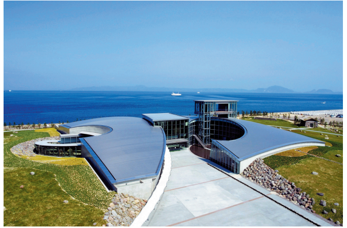
Gamadas Dome (Mt. Unzen Disaster Memorial Hall)