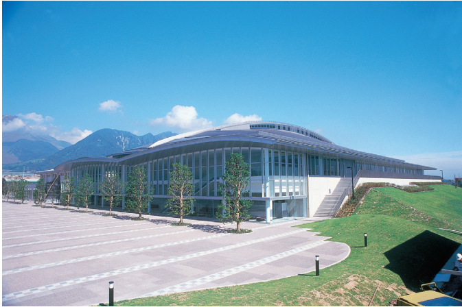
Shimabara Fukko Arena